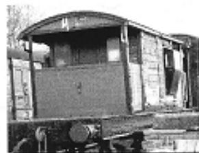
Brakevan rides soon at Roberts-bridge? See page 10