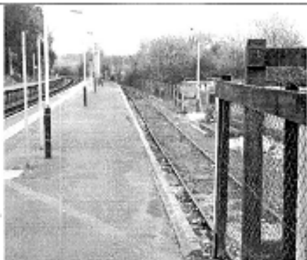
Above: Robertsbridge station, K&ESR bay platform, currently in use as an Engineers' siding.

Right: CSS members wait to board the train for Bodiam