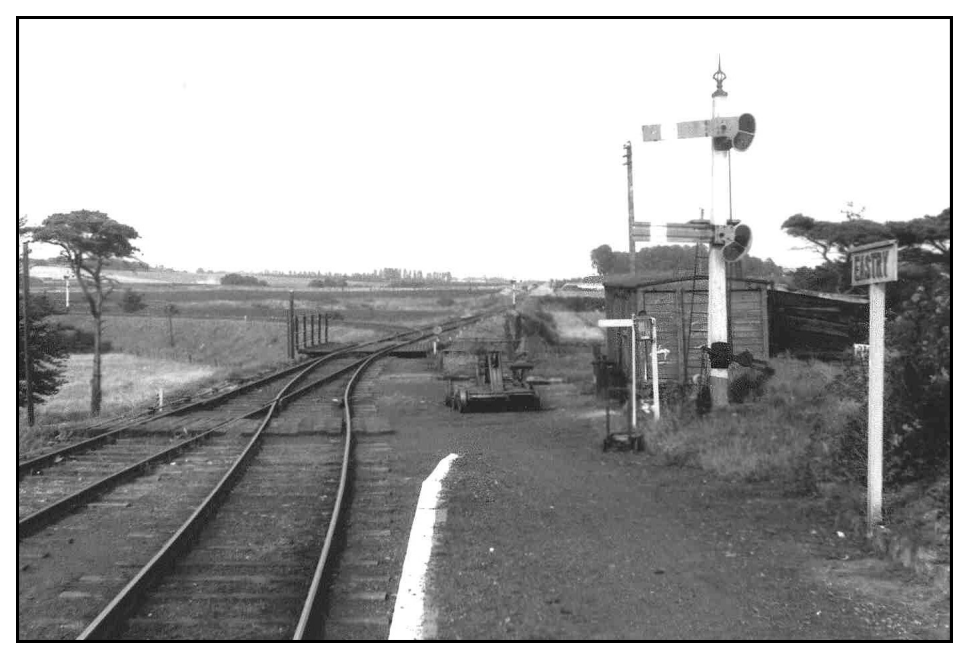
Sheer boredom: Eastry station on the East Kent Railway, where the frustration of hanging around for a mere two trains a day drove the young Monty Baker to seek solace in the arms of a beautiful local shop girl - and financial ruin.

Callington branch of the PD&SWJR, and the Colonel had brought him to the K&ESR.